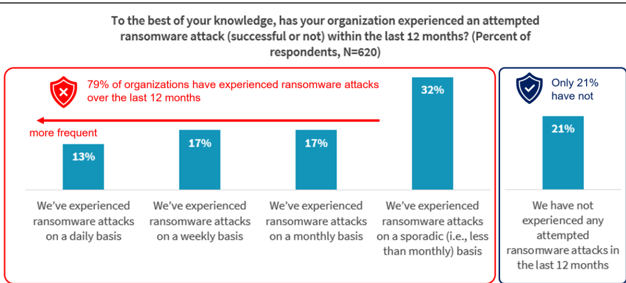
Figure 1. 79% of Organizations Report Having Experienced a Ransomware Attack in the Last Year

Source: Enterprise Strategy Group, a division of TechTarget, Inc.